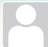
VACANT Director, Division 1