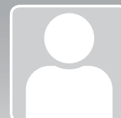
VACANT Director, Division 2